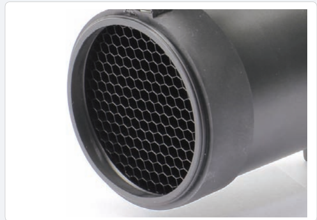
Anti - Reflective Filter