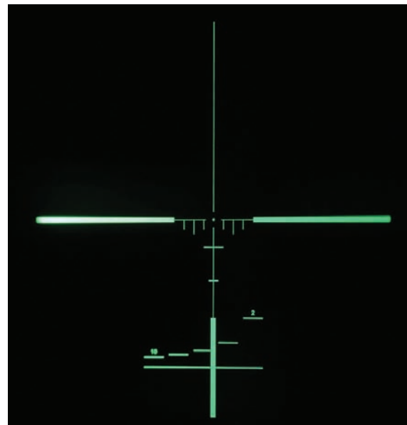
Reticles (Red & Green)