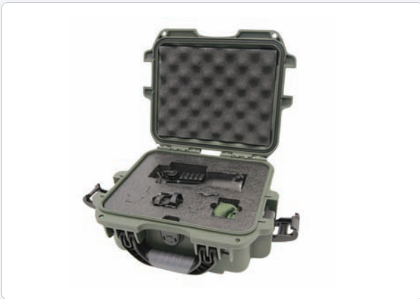
NC 6x50 Hard Case