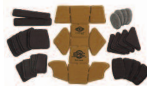
EPIC Pad System Also available in black