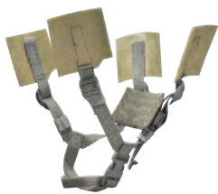
R11 Boltless Retention