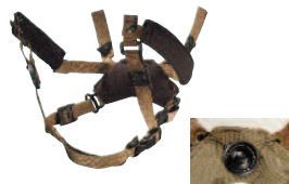
BOA 4-point Retention System with adjustable fit dial