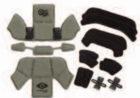
EPIC Air Liner System

This document gives only a general description of the product(s) and except where expressly provided otherwise shall not form part of any contract. From time to time, changes may be made in the products or the conditions of supply, which can cause slight variances in final weights. ArmorSource LLC, reserves the right to change product specifications without prior notice.