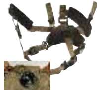
BOA 4-point Retention System with adjustable fit dial