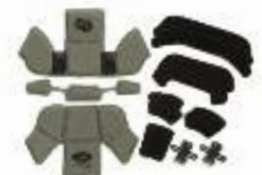
EPIC Air Liner System