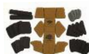
EPIC Pad System Also available in black