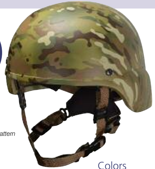
Shown with custom dipped multi-cam pattern and BOA retention