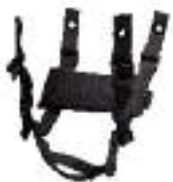
ASPS H-Back available in Black, Tan, Foliage Green or Olive Green.

Final retention construction may differ from photos shown.