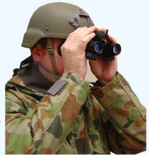
Hand Held Binocular