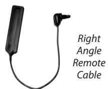
Right Angle Remote Cable