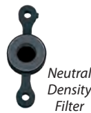
Neutral Density Filter