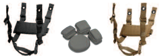
ASPS system with pads. Available in black, tan and green

Final harness construction and pad orientation may differ from photos shown.