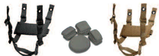
ASPS system with pads. Available in black, tan and green

Final harness construction and pad orientation may differ from photos shown.